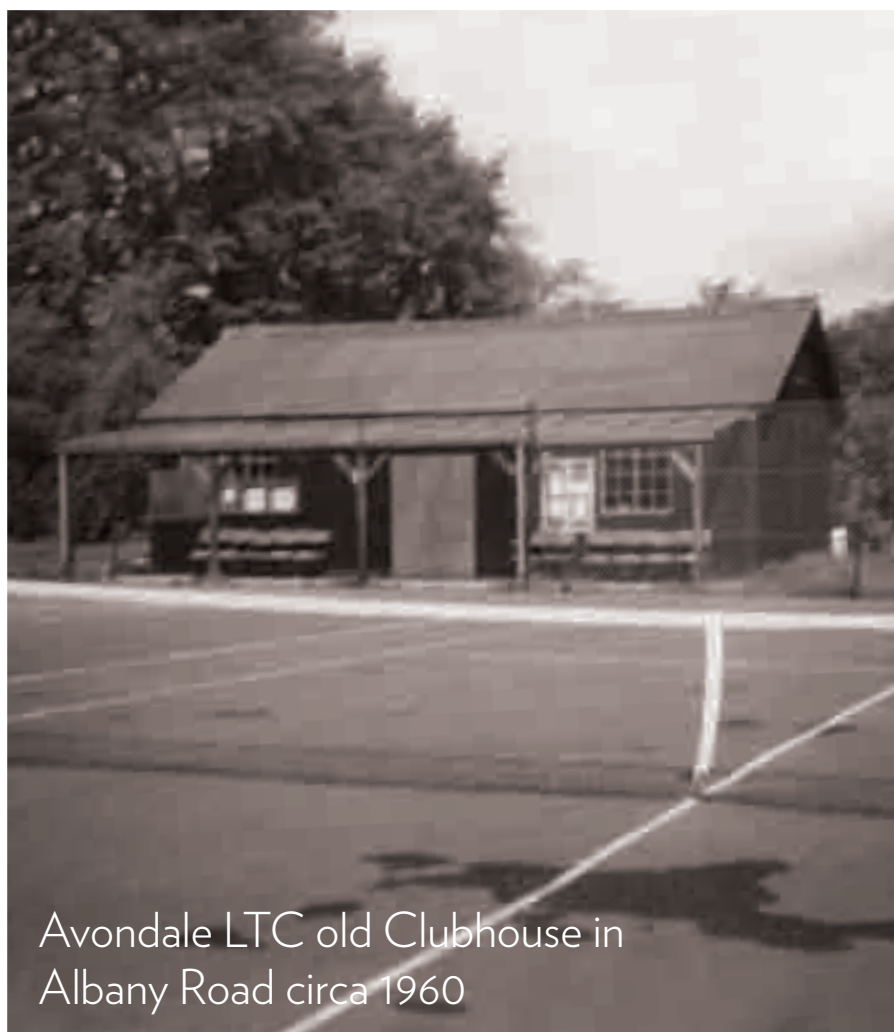
Avondale LTC old Clubhouse in Albany Road circa 1960