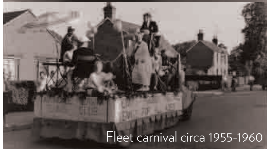
Fleet carnival circa 1955-1960