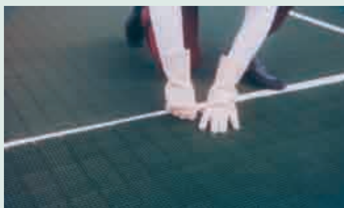
another block pressed into place

My personal recollections are having the honour of representing Hampshire in several matches and probably the most memorable occasion was in 1981 when a team of 4 of us played in a National Mens Doubles competition reaching the last 8 in the country, finally losing to Queens Club in London.