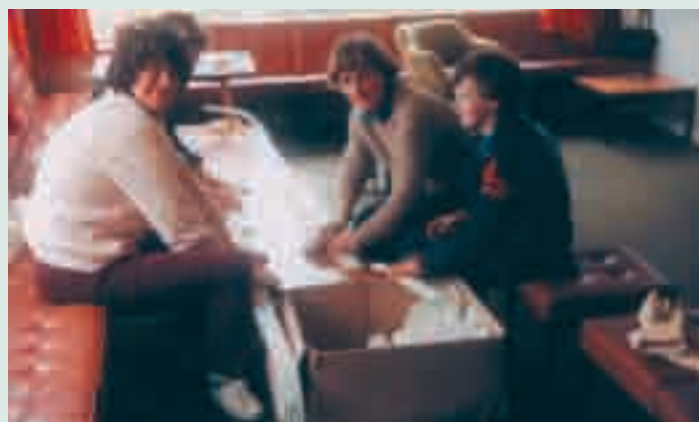
putting the white lines together for the Bioflex Courts

IOW Leagues and a thriving junior section, leading to the club we all know today.